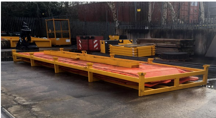
Left: UTAS unit in cage; total weight 2.5 tonnes