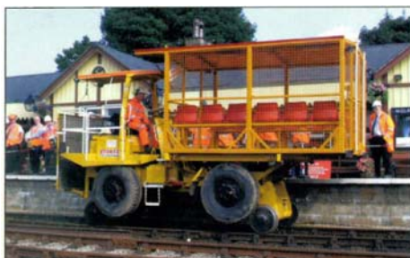
Example of GOS (Philmor) converted Rexquote (Thwaites) personnel carrier