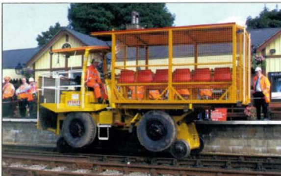
Example of GOS (Philmor) converted Rexquote/Thwaites personnel carrier

A further bulletin will be issued once the failure mode is properly understood.